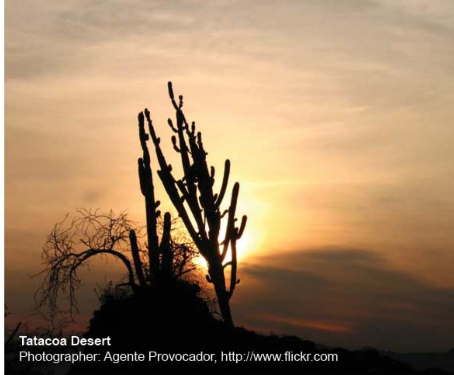
Tatacoa Desert