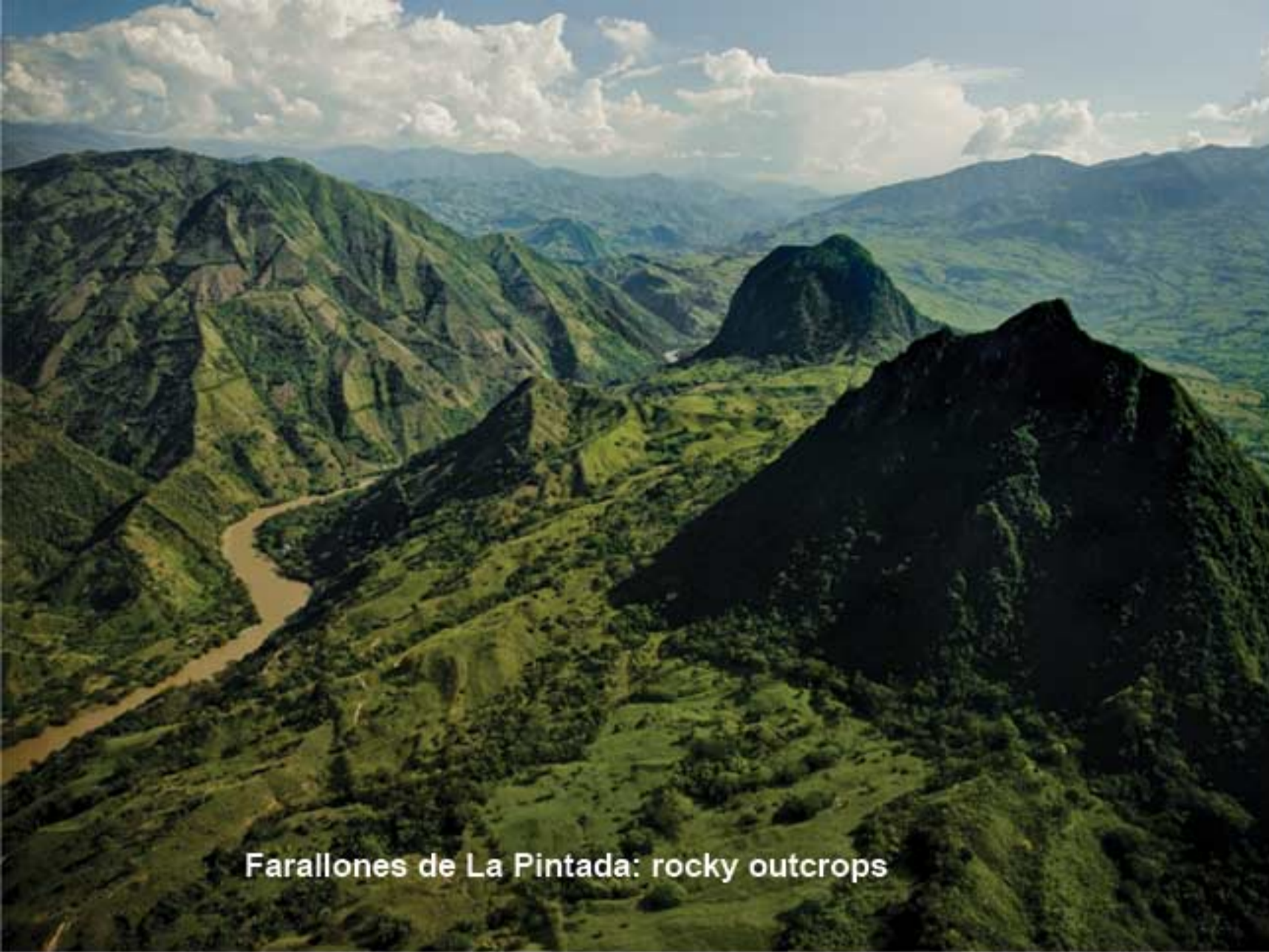
Farallones de La Pintada: rocky outcrops