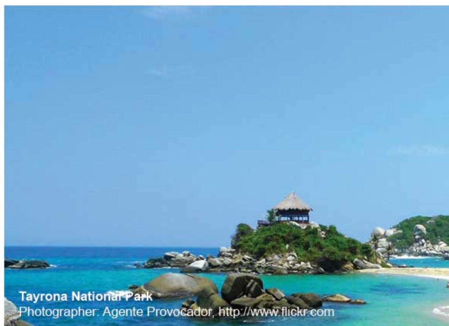
Tayrona National Park