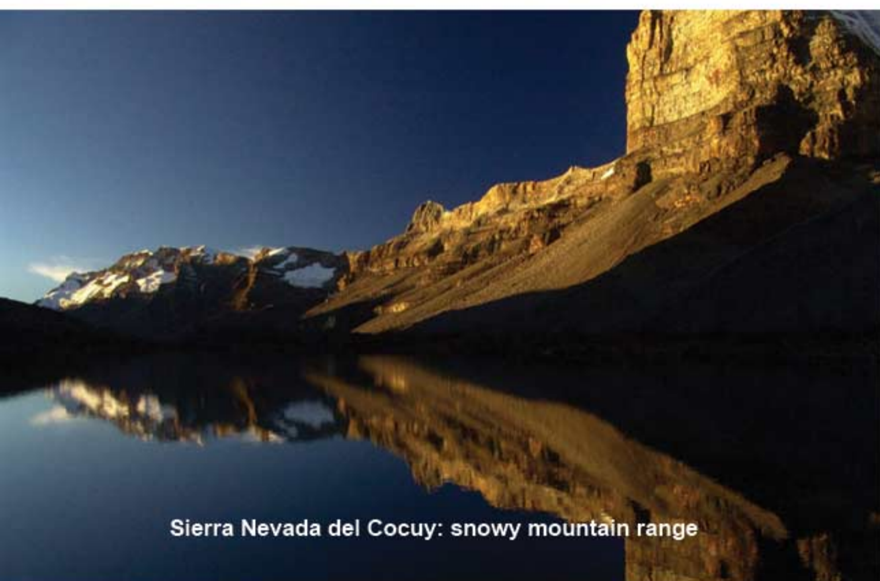
Sierra Nevada del Cocuy: snowy mountain range